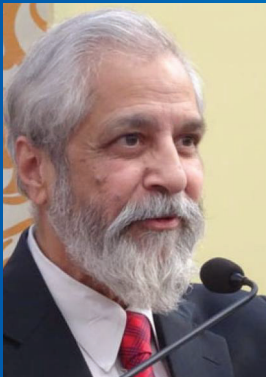
Madan Bhimarao Lokur Former Judge, The Supreme Court of India