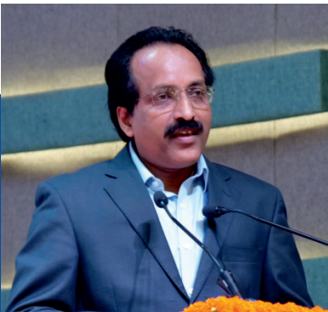
Dr. S. Somanath ISRO Chairman