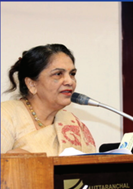
Gyan Sudha Misra Former Judge, The Supreme Court of India