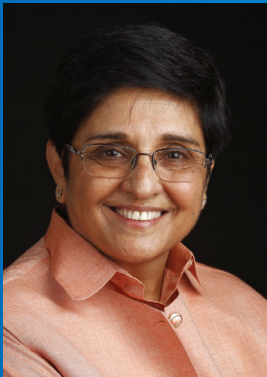
Dr. Kiran Bedi 1 st lady IPS Officer